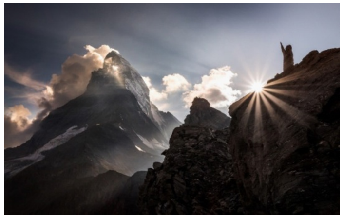
Matterhorn from Hirli

The winning photographs of the AC Photo Competition 2017 were both by Ben Tibbetts