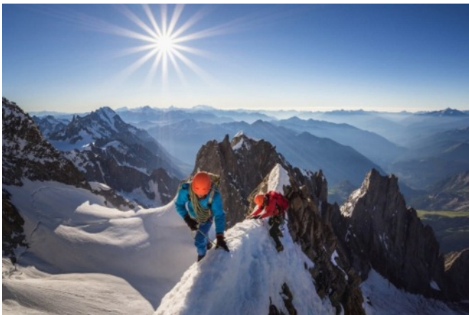
Innominata Ridge, Mont Blanc

The winners and runner-up photographers are listed on the Club web-site; the winning photos are below