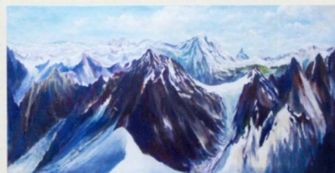
View from the Aiguille du Midi towards Switzerland