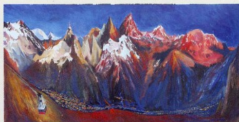
Chamonix valley imagined from the Brevant